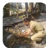
S.B.GARDA COLLEGE 20 GUJ. BN NCC NAVSARI