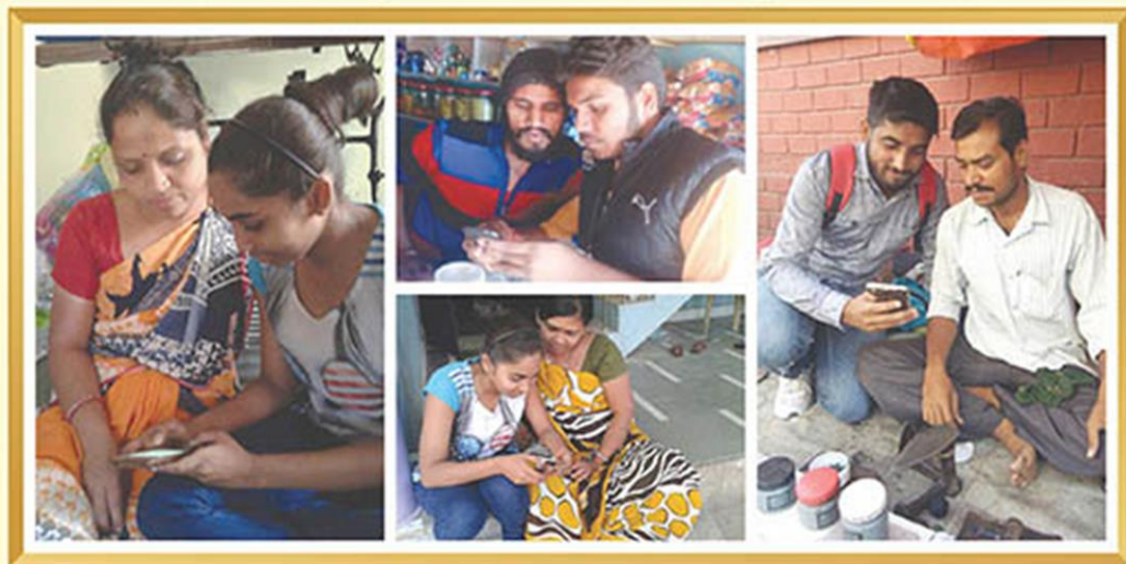
NSS students educating and training community members different modes of Digital Payments