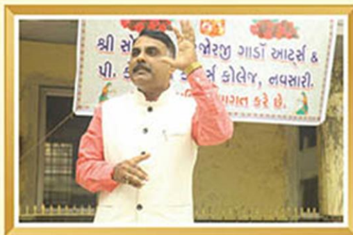
I/C Principal delivering his inspiring speech on the Occasion of Independence Day