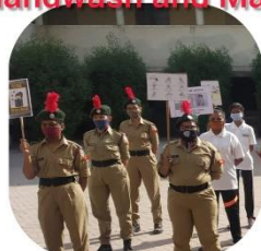
S.B.GARDA COLLEGE. 20 GUJ BN NCC NAVSARI