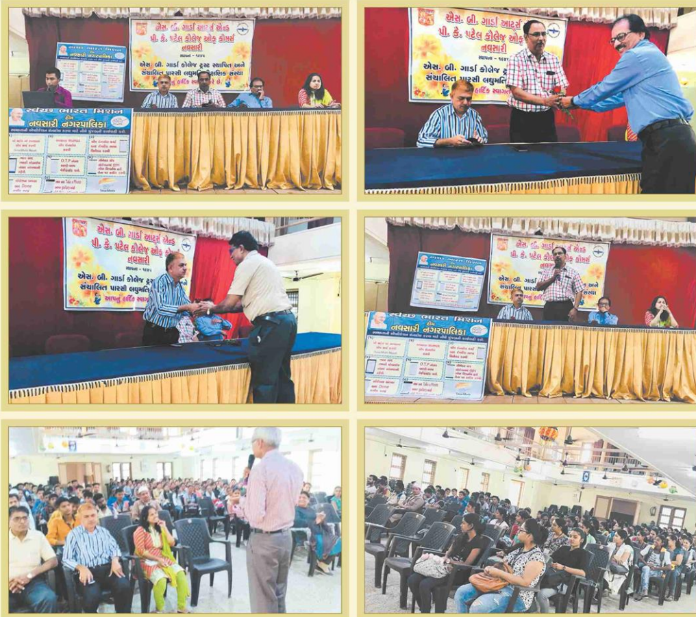
PHOTOS OF SWACHHATA AWARENESS PROGRAMME HELD ON 28-02-2018