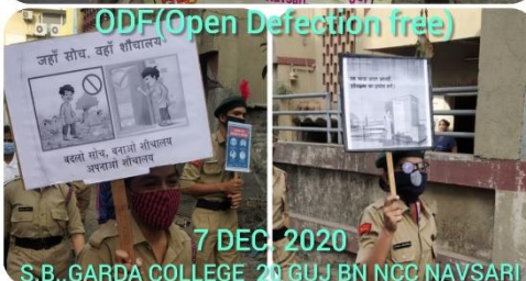
ODF (Open Defection free)