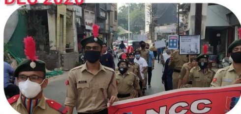
Handwash and Mass Awareness Rally