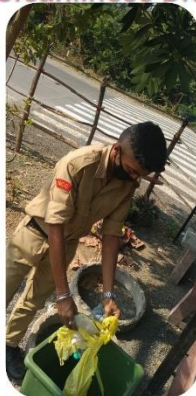
S.B.GARDA COLLEGE. 20 GUJ. BN NCC NAVSARI