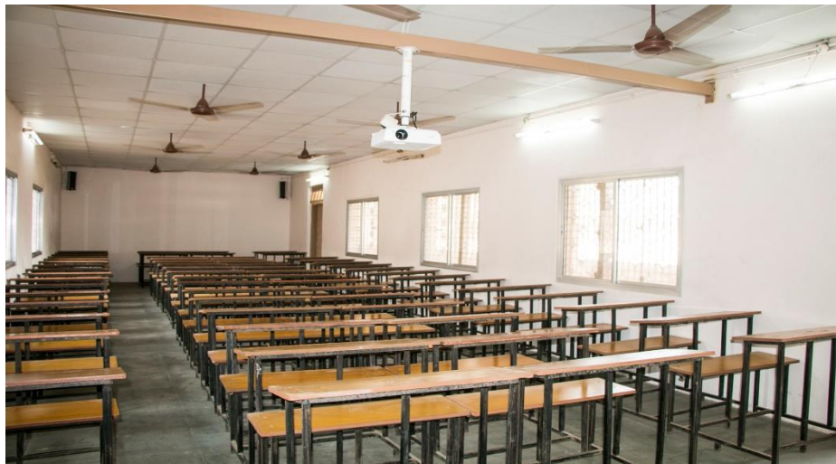
ROOM NO. 41 (LECTURE ROOM)