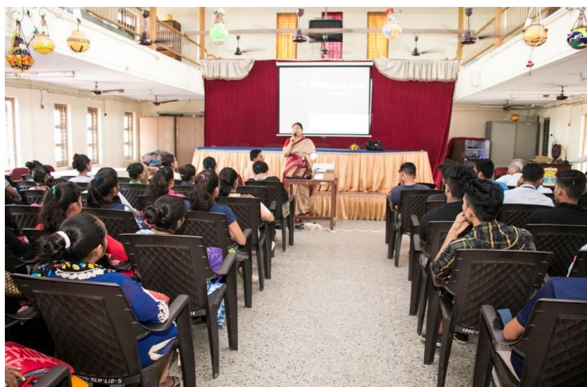
NEW LIBRARY HALL