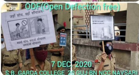
7 DEC 2020 S.B..GARDA COLLEGE 20 GUJ BN NCC NAVSARI