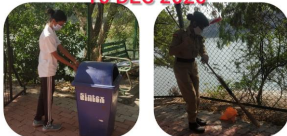
S.B.GARDA COLLEGE 20 GUJ. BN NCC NAVSARI