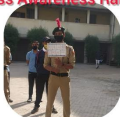
S.B.GARDA COLLEGE, 20 GUJ BN NCC NAVSARI