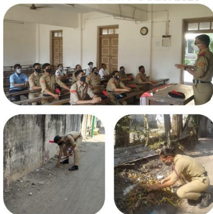
S.B.GARDA COLLEGE 20 GUJ. BN NCC NAVSARI