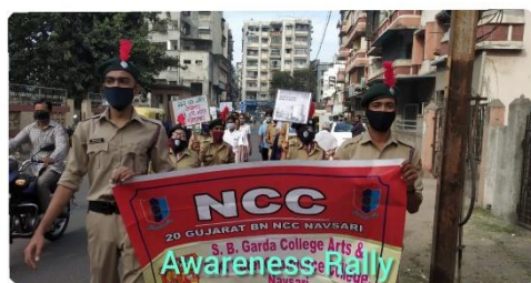
ODF (Open Defection free)