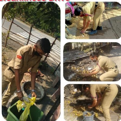
S.B.GARDA COLLEGE. 20 GUJ. BN NCC NAVSARI